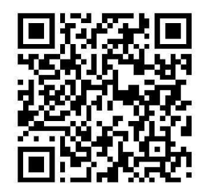
Scan here to sign up!